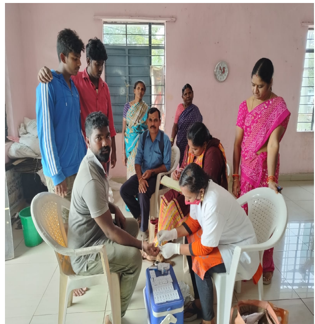
HIV/AIDS Screening camp