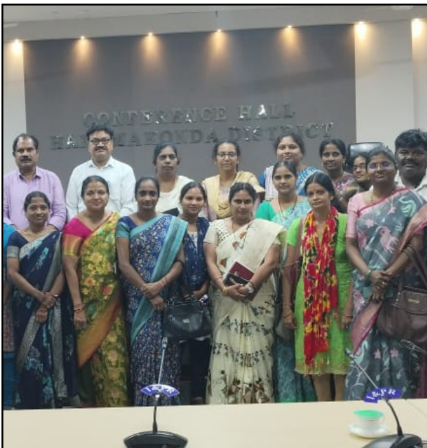
Group photo with District Officials after completion of District Level Awareness Program on HIV/AIDS