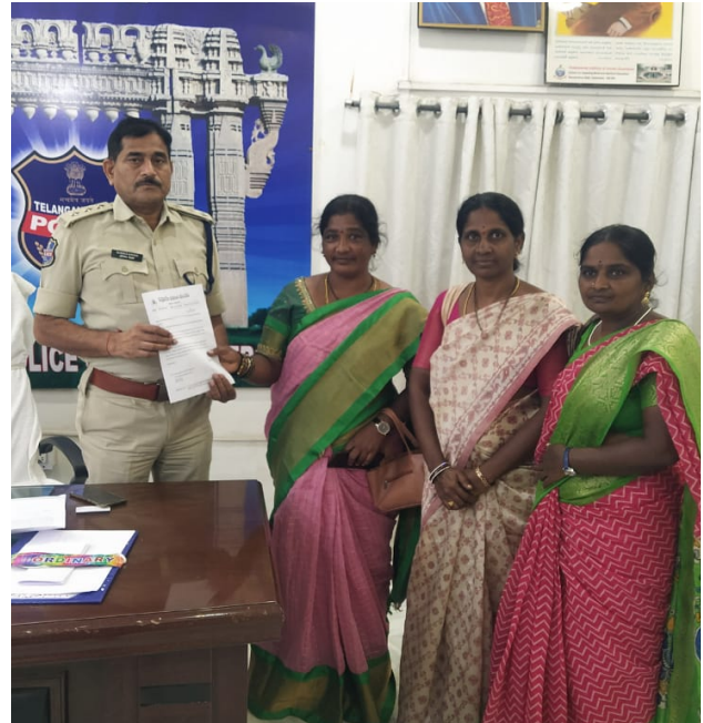
Advocacy and crisis management meeting with the Police Commissioner, Warangal