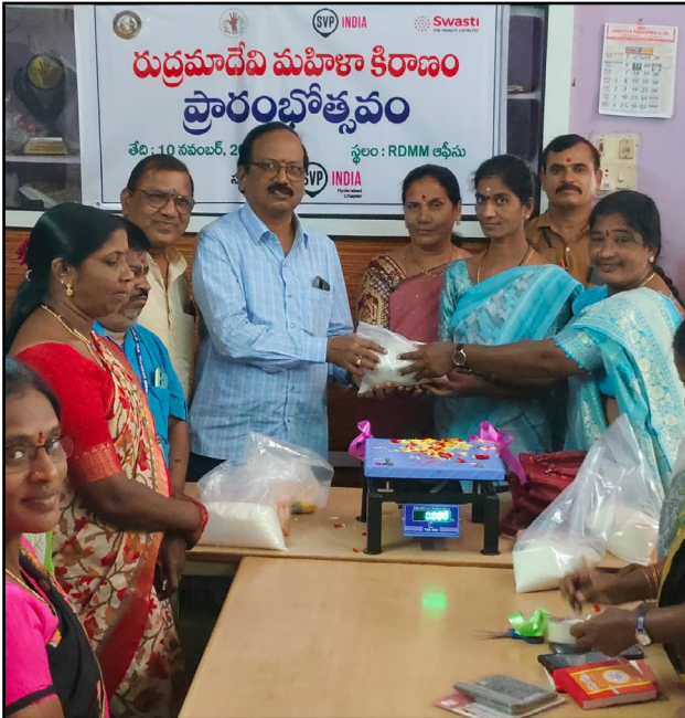
Inauguration of a grocery shop at the RDMM office, managed by the community