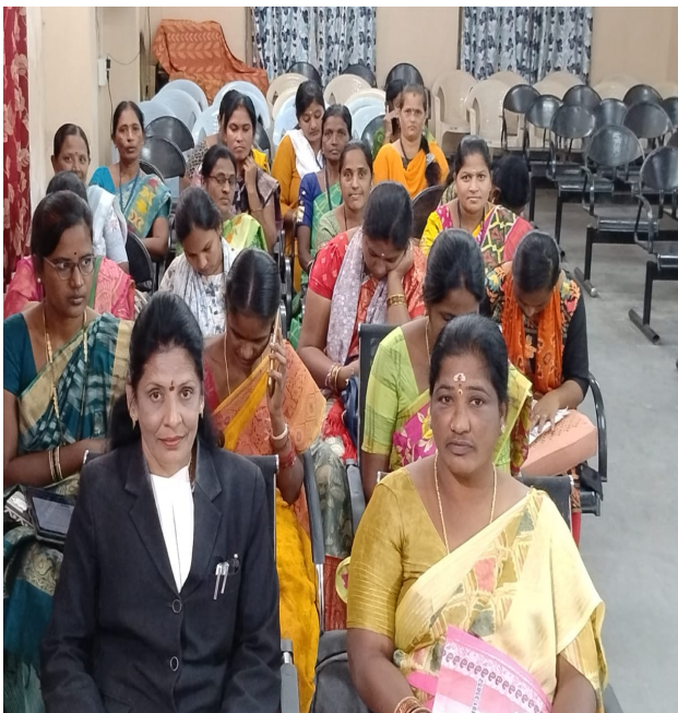
Legal Awareness program