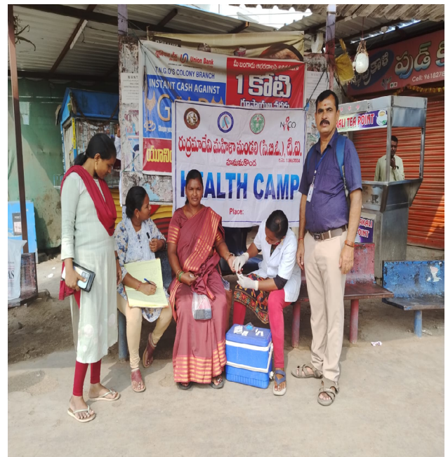
HIV/AIDS Screening camp