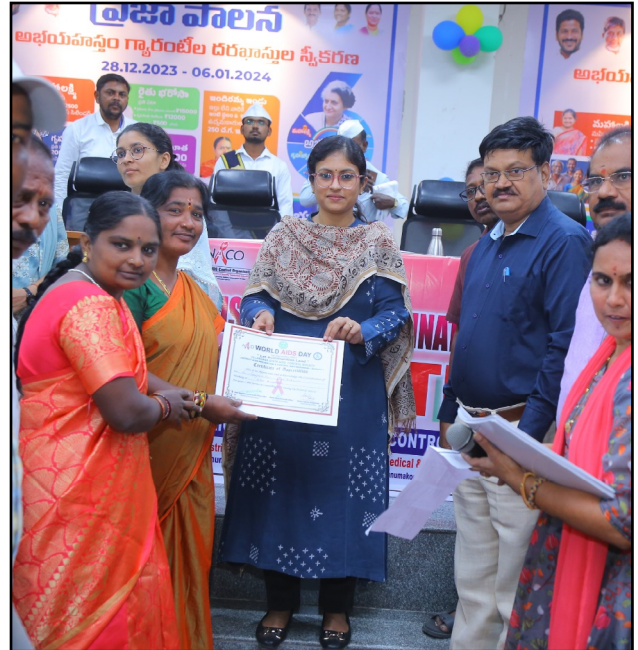
Felicited for Best HIV/AIDS services by the District Collector in presence of DMHO officials and the DPM