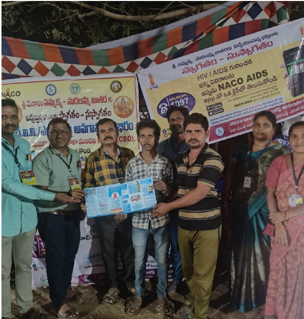
Awareness camp on HIV/AIDS prevention and treatment during the Medaram Sammakka Saralamma Jathara